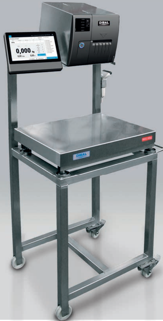
Image of the ML structure with Dibal LP5000 manual touch screen labelling equipment and platform. (Weighing and labelling equipment not included)