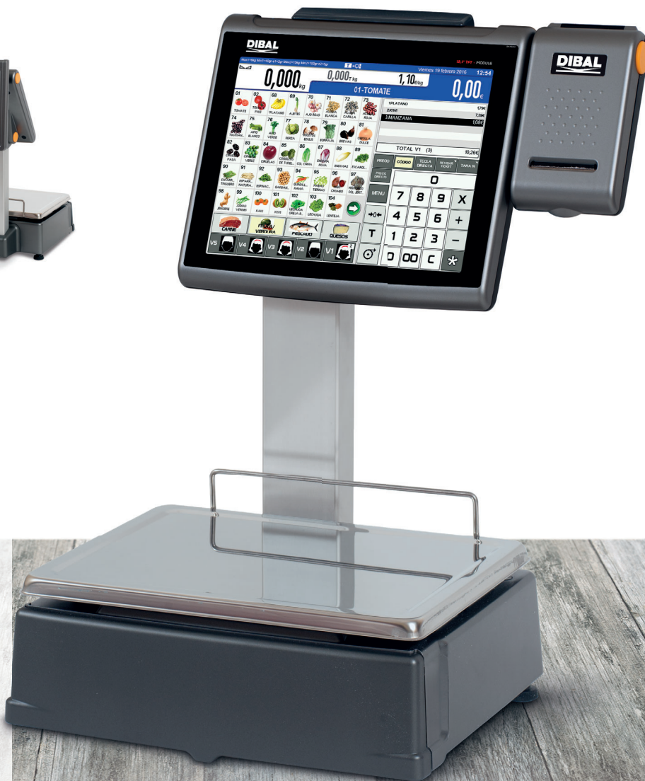
Plate dimensions: L360 x W280 mm. Weight with packaging: 21.0 kg.